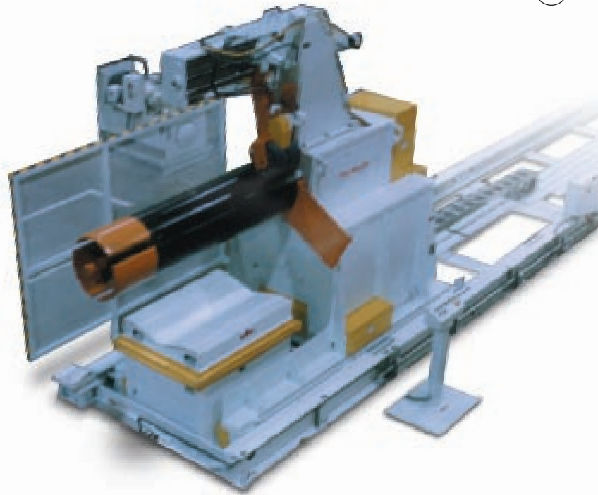
Model RST407272 traversing reel and coil lift