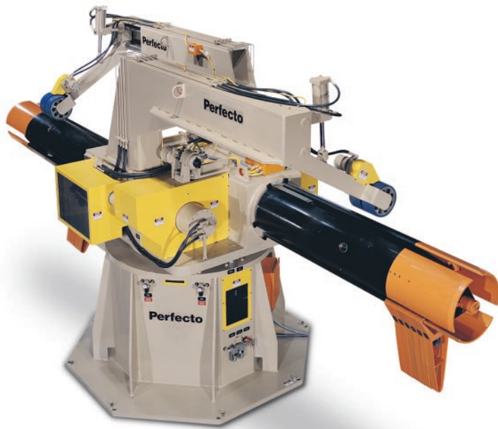
Model RD507284 with dual restrictor wheels.